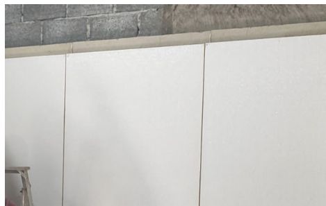
Glasbord® with Surfaseal® Sandwich Panels (Hygispan®)