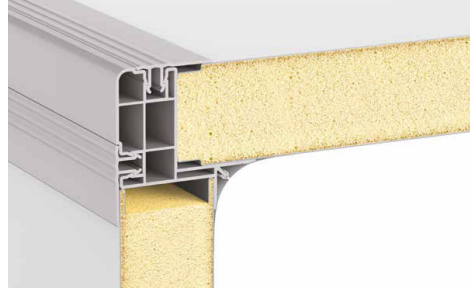
Glasbord® with Surfaseal® Modular Panels (Hygicold)