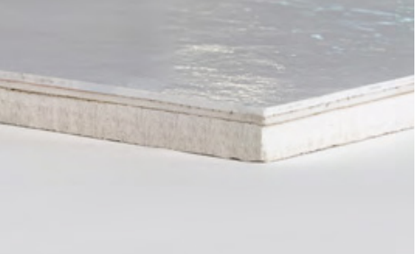
Glasbord® with Surfaseal® laminated on Rigid Board (Hygimat)